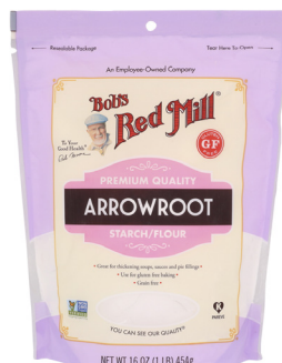
Bob's Red Mill Arrowroot Starch