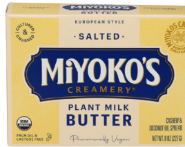
Miyoko's Organic Cultured Vegan Butter